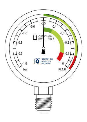
Fig. 4-1: Breakdown of the display panel

The leakage indicator consists of a low-pressure Bourdon tube pressure gauge which corresponds to accuracy class 1.0 or 1.6 in accordance with EN 837-1 and which is filled with glycerine, as well as a control block with a valve for connecting to a mobile evacuation pump or a test fitting. The pressure gauge display panel has a measurement range of -1.0 bar to 0 bar and a diameter of Ø 50 to bis Ø 75 mm for container volumes \leq 1000 l and a diameter of Ø 100 to Ø 200 mm for container volumes > 1000 l. Alternatively, a filling of silicone oil may be used.